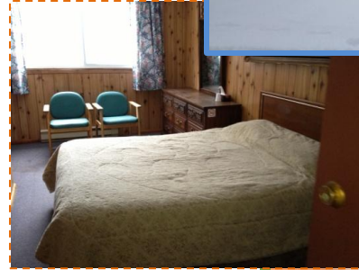
(up) hotel room (down) cabin