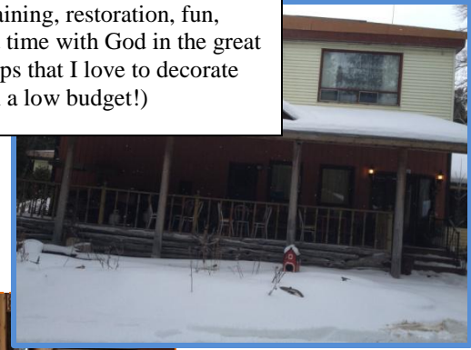
(up) front of main building (down) Indoor pool

Beauty is in the eye of the Beholder. Look past the outdated photos and see with Kingdom eyes the potential for rest, revitalization, training, restoration, fun, rejuvenation and time with God in the great outdoors. (It helps that I love to decorate and do it well on a low budget!)